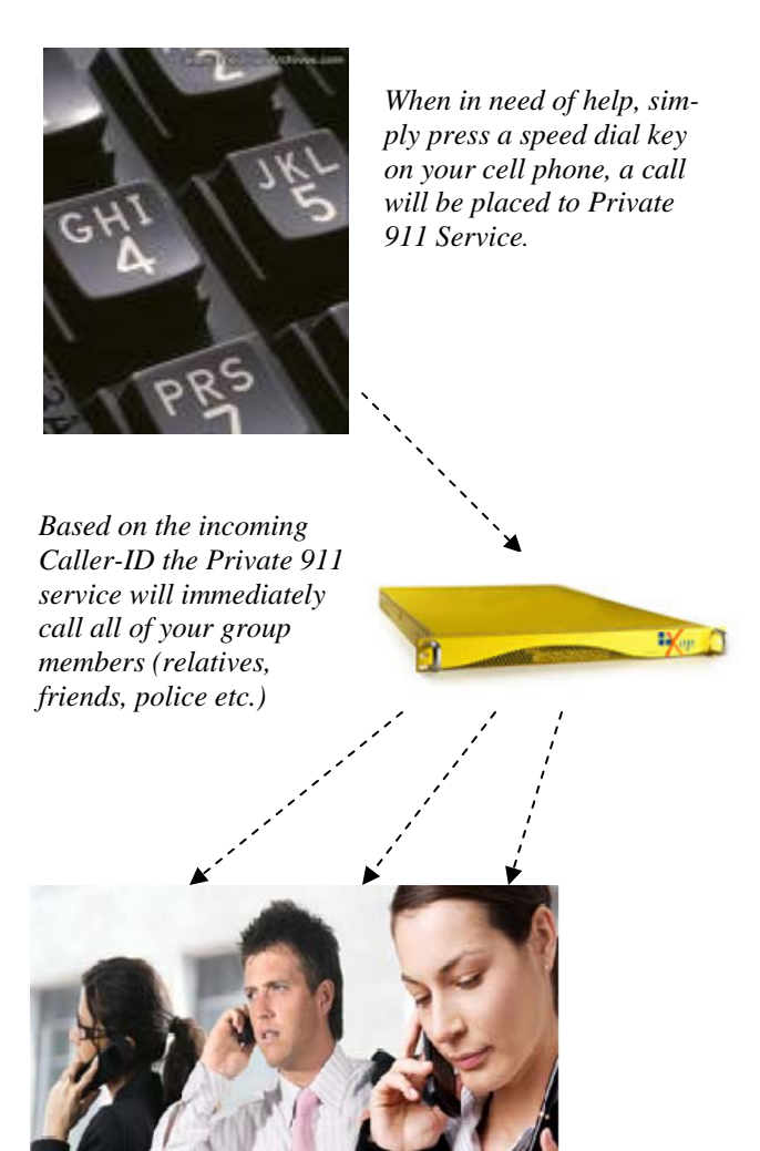
As they pick up their phones they will be placed in a conference with you. Jointly people can then discuss and take any necessary action as required.

Fast – Quickly launch an emergency conference call by pressing a speed dial key on your cell phone handset or you can dial the Private 911 service number from any phone. Within seconds you will be talking to your pre-selected group of people. No need to remember any dial in number or any PINs etc for the audio conference service.